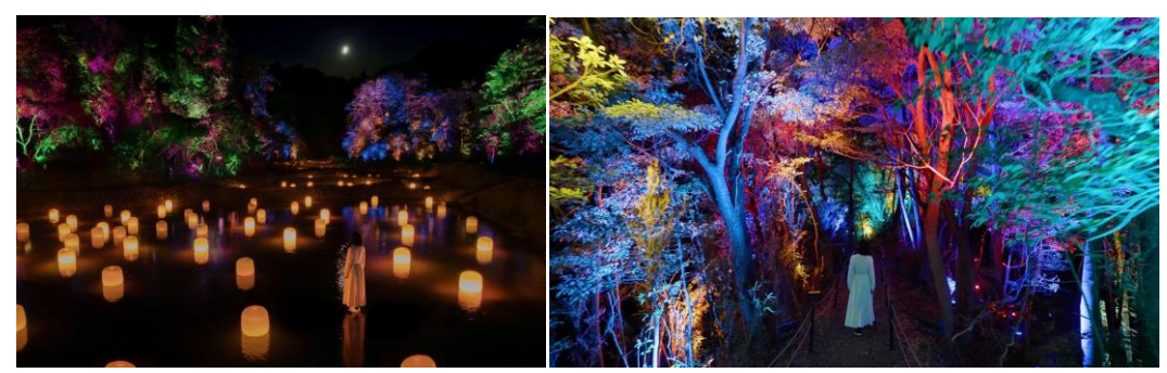
teamLab: Hidden Traces of Rice Terraces, Ibaraki, Izura

1. Step Into a Fantastic World at teamLab's New Exhibition, Opening September 30, Ibaraki