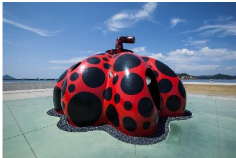
"Red Pumpkin" Yayoi Kusama, 2006 Naoshima Miyanoura Port Square, Photo/Daisuke Aochi ©YAYOI KUSAMA

(Reproduction of this image is strictly prohibited.)