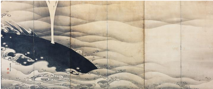
ITO Jakuchu, Elephant and Whale, left screen, 1795 (Kansei 7) ink on paper; pair of six-fold screens, MIHO MUSUEM