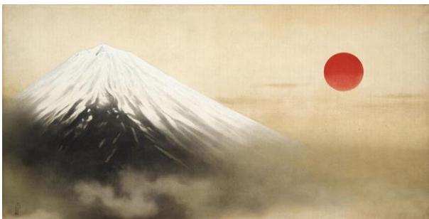
Land of the Rising Sun, Japan. Yokoyama Taikan. Showa era, 1940