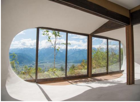
©目[mé] 《Tangible Landscape》 2017