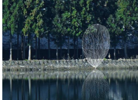
©Aleksandra Kovaleva & Kei Sato / KASA (Russia,Japan) Memories of Water Image of Artwork

The Northern Alps Art Festival features works by artists from both Japan and abroad. Located among the 3,000-meter-high peaks of the Northern Alps in northwestern Nagano Prefecture, visitors can enjoy thought-provoking art exhibits while basking in the picturesque nature of the region, which this year's concept is based on. The site-specific art installations are divided up among five different areas around the city based on their characteristics, utilizing the unique characteristics of their locations and creating eye-catching pieces that simultaneously blend in with their surroundings. The rich nature further emphasizes the effects of the pieces, as the sounds of rustling leaves, chirping birds, and rushing water can be heard while observing the art. There are also weekend performances held during the festival. Tickets for the Northern Alps Art Festival are now available for purchase, so check the official site for more information.