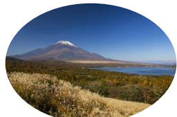
Yamanashi: Cycling road races