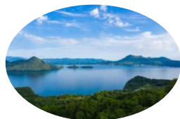
Hokkaido: Marathon, Race walking, Football