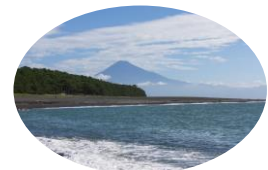
Shizuoka: Cycling road races, Mountain bikes, Tracks

Note: Includes both Olympic and Paralympic Games venues