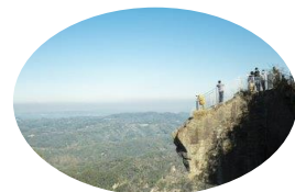
Chiba: Surfing, Fencing, Taekwondo, Wrestling, Goalball, Sitting volleyball, Taekwondo, Wheelchair fencing