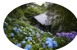
Kanagawa: Baseball, Softball, Football, Sailing, Cycling road races