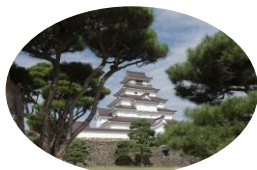
Fukushima: Baseball, Softball