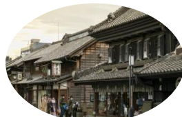
Saitama: Basketball, Football, Golf, Shooting

Please click on prefecture names for local info